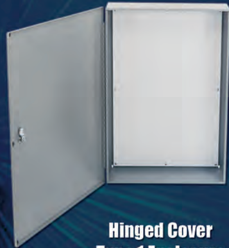
Hinged Cover Type 1 Enclosure