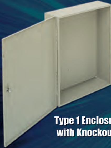
Type 1 Enclosure with Knockouts

Whether you require a standard stock enclosure or a custom built enclosure, SCE can be Your Enclosure Source ® .